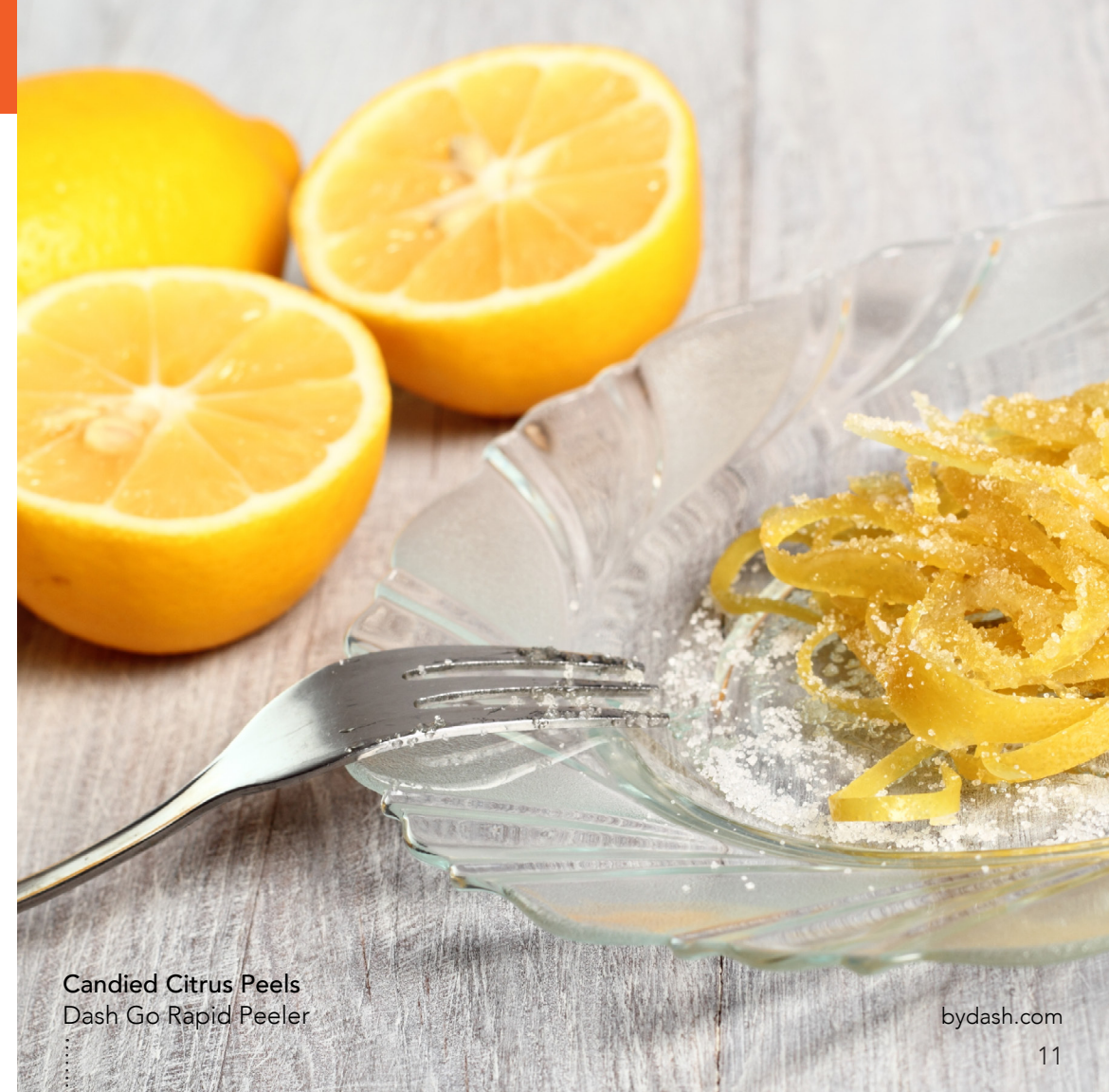
Candied Citrus Peels Dash Go Rapid Peeler