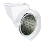
KitchenAid® Rotor Slicer/ Shredder Model RVSA