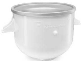
KitchenAid® Ice Cream Maker Model No. KAICA

Purchase a qualifying KitchenAid® Stand Mixer* and receive a FREE Ice Cream Maker (a $79.99 value) by mail.